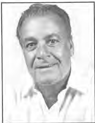
JOE WALTON Offensive Coordinator

Joe Walton became offensive coordinator on Feb. 16, 1990 after 7 seasons as head coach of the New York Jets. Beginning his 31st season in the NFL this year, Walton has been an NFL coach for the past 21 years after a 7-year playing career and 2 seasons as a scout.