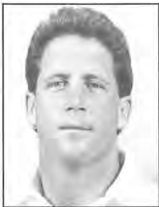
JOHN FOX Defensive Backs Coach

John Fox begins his third season as the Steelers' defensive backs coach after joining the team Feb. 10, 1989. His first NFL coaching position followed 3 years as defensive coordinator and secondary coach at the University of Pittsburgh.